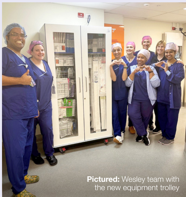
Pictured: Wesley team with the new equipment trolley